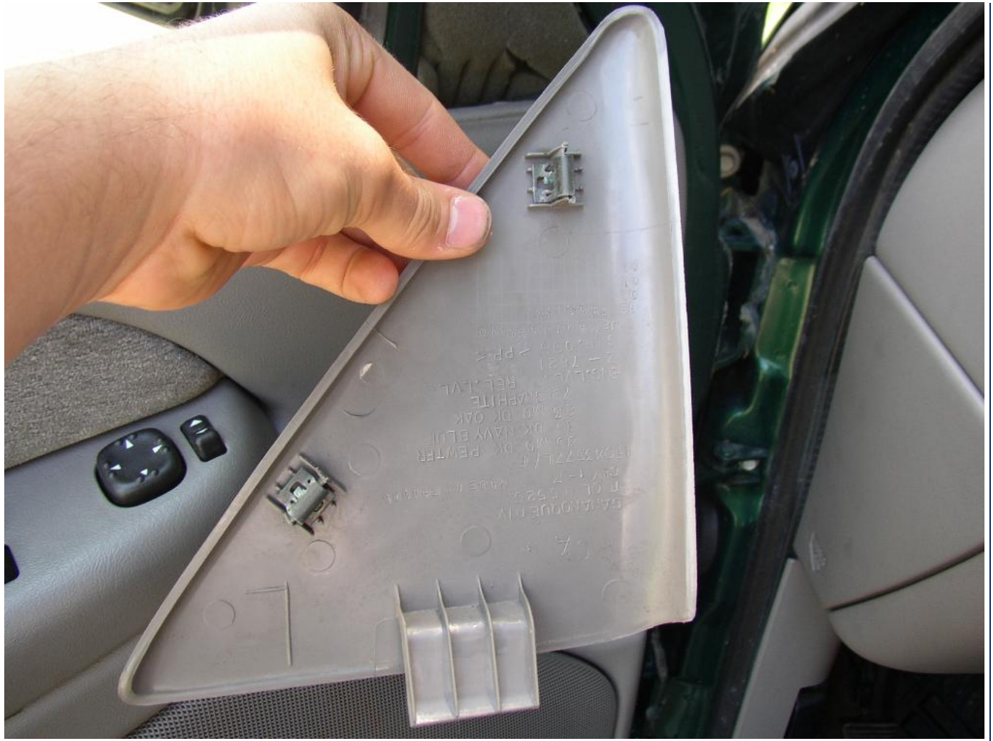
Step 2: Remove the lock cover with a flat-head screwdriver.