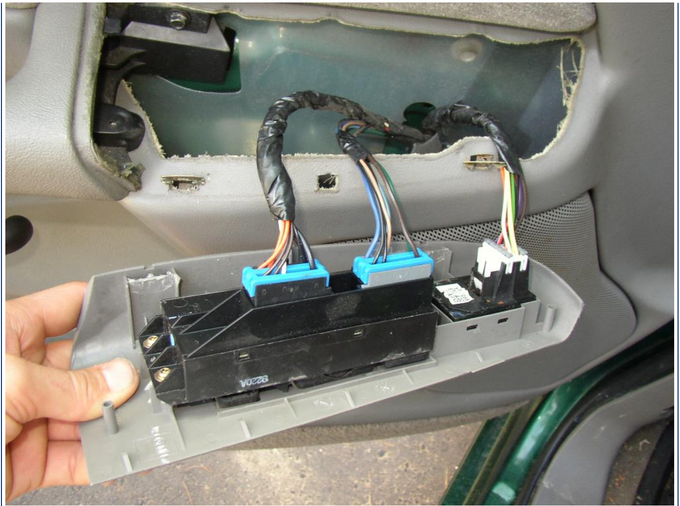
Step 5: Next remove the two 7mm screws. One is behind where the piece with the plugs was, and the other is behind the armrest/handle thingy.